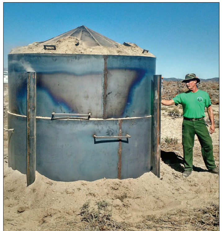
Figure 4. Kiln used to convert juniper slash into biochar.

One way to increase the conversion of forest woody residues into biochar is to expand markets for using