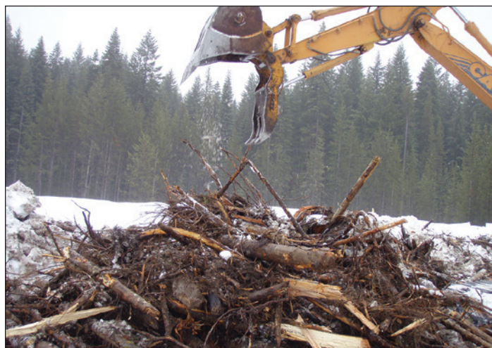
Figure 1. Burning large slash piles can cause long-term damage to soil.

Many forests, especially those in the Western United States, face management challenges related to wild-fire, insect and disease outbreaks, and invasive species because of overstocked or stressed stands (Weather- spoon and Skinner 2002). The nexus of these challenges facing land managers is what to do with the resulting excessive wood on forest sites that has little or no economic value. This wood comes from precommercial thinning of overstocked stands to reduce fire hazard, tremendous loss of standing timber to drought and bark beetle infestation (i.e., 29 million trees in the Sierra Nevada as of 2015), and conventional thinning and logging (Thibodeau et al. 2000, Fetting et al. 2019). Combined, these activities have created, literally, mountains of slash that are eventually burned (figure 1). Although slash pile burning is an economical method for disposing of undesired woody residues, burning can wreak havoc on the soils beneath piles, often rendering them