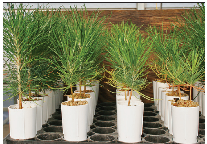
Figure 6. Left to right: Seedlings grown with 0-, 25-, 50-, or 75-percent granular biochar at the 80-mg N rate.

This trial also used biochar powder from a woody feedstock (Matt et al. 2018). Because of our results with 25-percent granular biochar in previous trials, we bracketed our rates in this experiment around that value, and replaced peat with biochar at rates of 0, 15, 30, and 45 percent (by volume). We also looked at three plant forms (i.e., tree, forb [an annual and a perennial], and grass). Ponderosa pine was the tree, pinkfairies ( Clarkia pulchella Pursh) was the annual forb, blanketflower ( Gaillardia aristata Pursh) was the perennial forb, and Idaho fescue ( Festuca idahoensis Elmer) was the grass. We strictly controlled the N rate and irrigation to ensure all treatments were given the same amounts. In this trial, we found similar biomass (shoot, root, total) regardless of biochar rate for everything except the grass, which performed poorer than the control when any rate of biochar was added (Matt et al. 2018). A notable result from