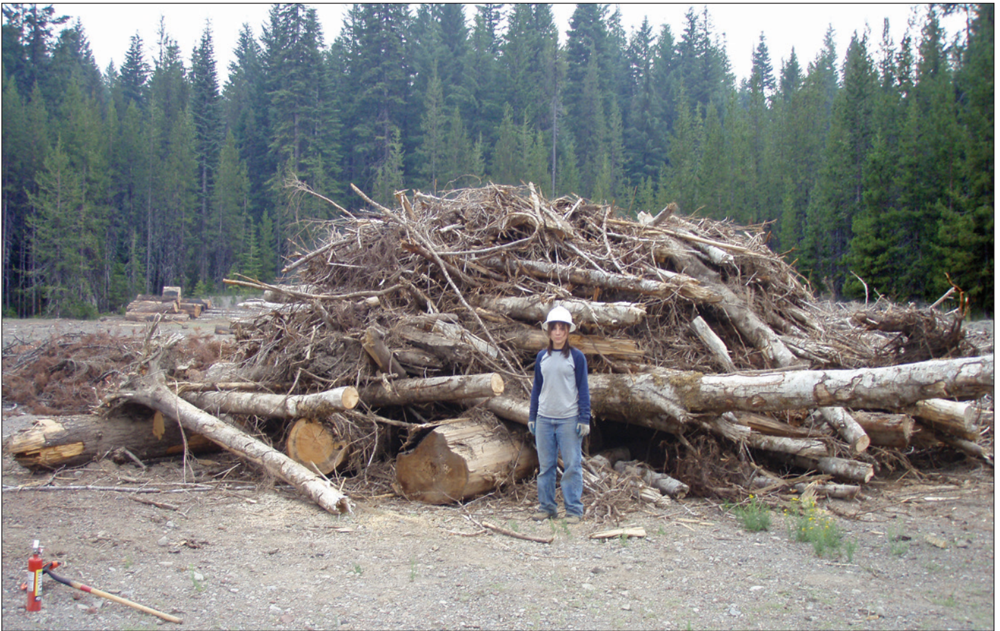
Figure 3. Slash pile built to maximize biochar production. Note the larger diameter logs at the bottom; they help keep the heat away from the soil surface and provide maximum airflow.