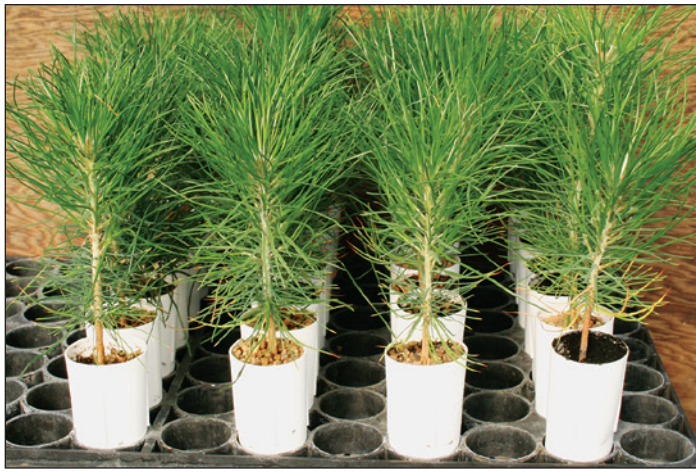
Figure 7. Short-term nutrient problems can be overcome by manipulating the fertigation regime. Left to right: Seedlings grown with 0-, 25-, 50-, or 75-percent granular biochar and receiving 80, 100, 117, and 114 mg N, respectively, in order to achieve the same overall growth as the control (i.e., 80 mg N).

this trial was the reduced irrigation frequency afforded by the biochar (table 2; Matt et al. 2018).