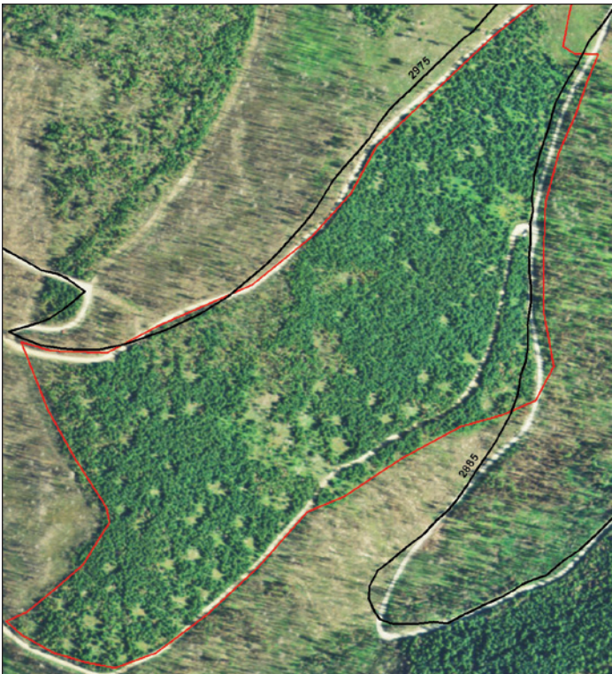
Figure 2. Slash pile burn openings (non-green dots) created when large piles were burned 50 years ago.

(table 1). Biochar derived from burning wood usually has a pH that is compatible with plant growth, whereas some feedstocks, such as poultry litter, yield biochar with very high (>8) pH (table 1). The benefits of adding