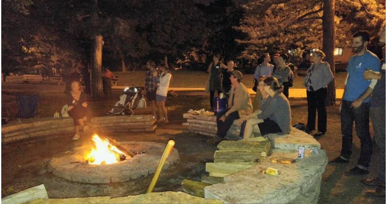
Image 2. CRTI Annual Meeting and Celebration Event hosted by the Chicago Park District