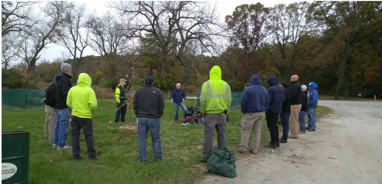
Image 1. City of Chicago Forester teaching tree planting techniques for balled and burlapped trees at a Community Tree Network.